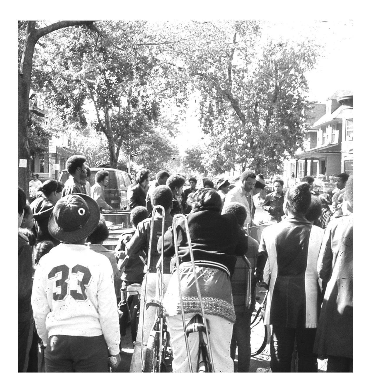
Figure 4. Caribbean Band in Prospect Lefferts Gardens, Brooklyn. 1975 by Jerry Krase.

Note. In the 1970s the Prospect Lefferts Gardens was stigmatized a dangerous black ghetto. Here is a photo from a neighborhood association block party.