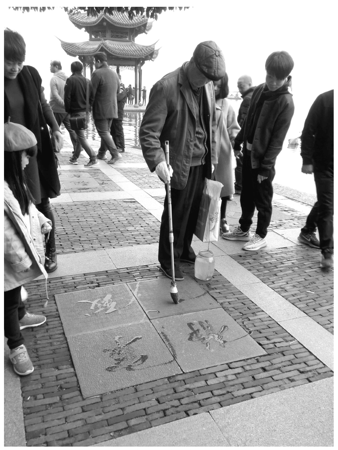
Figure 7. Artist in China, Hangzhou, China, 2017, by Jerry Krase.

day he opened fire, killing 69 more, at a youth camp because he thought it was necessary in order stop the "Islamisation" of Norway. Breivik also accused the governing Labour Party of promoting multiculturalism and endangering Norway's identity. It must be noted, that he was not declared insane despite appeals by prosecutors (BBC News, 2012). Since that horrific incident, Norway, as the rest of Europe, has seen the successful rise of anti-immigrant electoral politics.