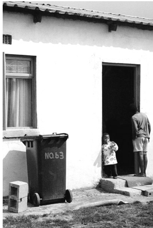
Figure 8. Child in Istanbul Mosque, 2010, by Jerry Krase. Figure 9. Cape Town Kids, Cape Town, South Africa, 2000.

Note. Pictures of children are powerful antidotes to denigrating images of all groups.