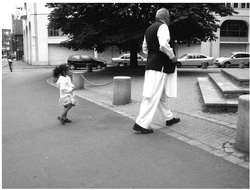
Figure 6. Grandfather and Grandchild in Oslo, Norway, 2020, by Jerry Krase.

Note .I bought this object at an antique store as a reminder of commonplace are stigmatizing racial stereotypes in American society. As a backdrop I placed a copy of the catalogue "Imprinted: Illustrating Race" presented at the Norman Rockwell Museum in Stockbridge, Massachusetts during the summer of 2022.